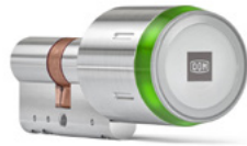
Double cylinder 1-sided readability for emergency exits without knob (Euro & Swiss profile)