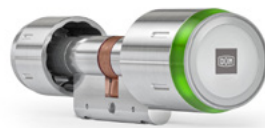
Double cylinder 1-sided readability short-long version (Euro & Swiss profile)