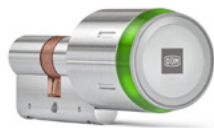
Double cylinder 1-sided readability without inner knob (Euro & Swiss profile)