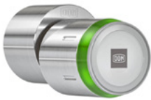
Scandinavian round profile