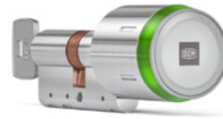
Double cylinder 1-sided readability for emergency exits with mechanical inner locking (Euro profile)