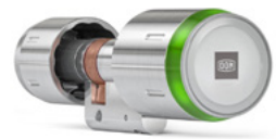
Double cylinder 1-sided readability for glass doors (Euro & Swiss profile)