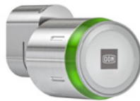
Scandinavian oval profile