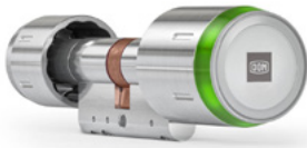
Double cylinder 1-sided readability for emergency exits (Euro & Swiss profile)