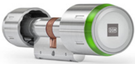
Double cylinder 1-sided readability (Euro & Swiss profile)